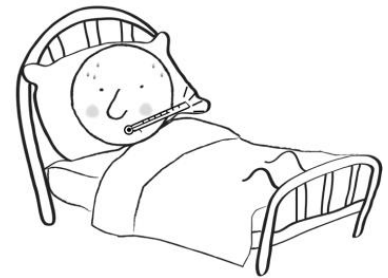
Rete lakay ou si w malad

Mande doktè w pou vaksen kont grip la jodi a!