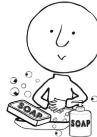
Lave men w