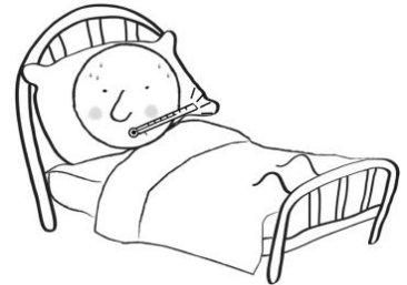
Joog guriga markaad jirran